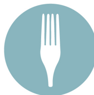
Table served salad on glass salad plate, salad fork and rolls in bread basket..... $5pp++